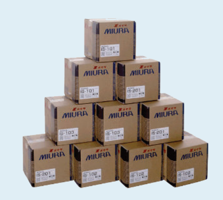
50+ Years of BOILERMATE® History

One result of the water treatment research was the development of the BOILERMATE® series chemical treatment products in 1971. In 2002, after continued research and product evolution, Miura developed our flagship product, BOILERMATE®1200S silica-based boiler treatment. It uses the naturally occurring ingredient, silicate, as a protective agent against corrosion within the boiler. Miura also produces a full lineup beyond BOILERMATE®1200S to cover a range of our customers' water treatment needs.